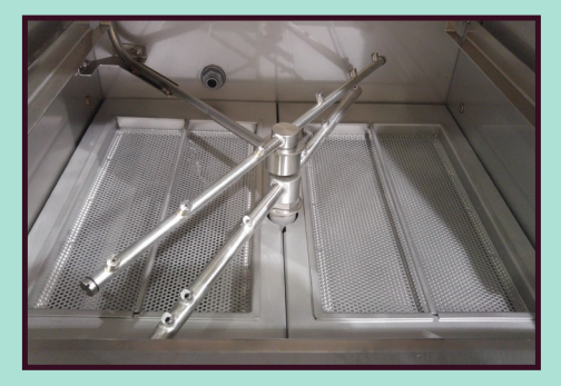
Interchangeable Scrap Baskets