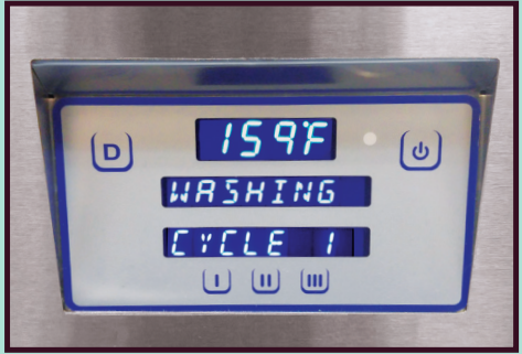
Digital LED Control Panel